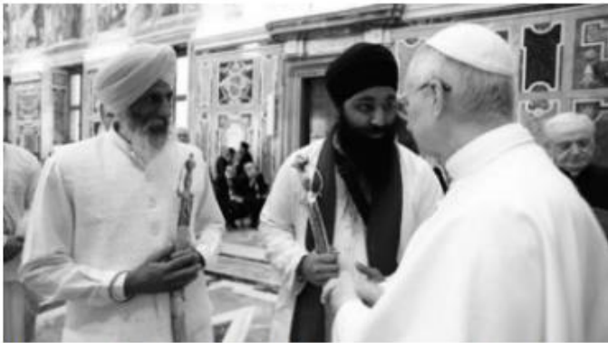
Pope Leo XIV meets with representatives of various Churches and religions on Monday